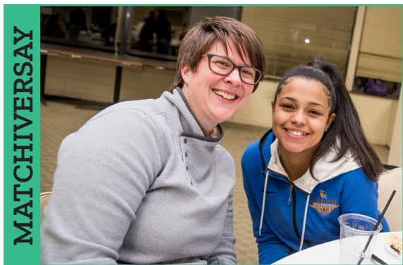
Celebrating Matches who have been together for 5+ years