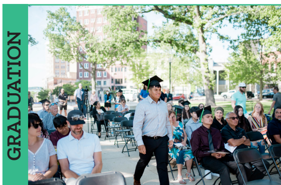
Recognizing the Matches who are graduating and aging out of the program