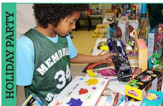
Kicking off the holiday season with fun activities and donated gifts