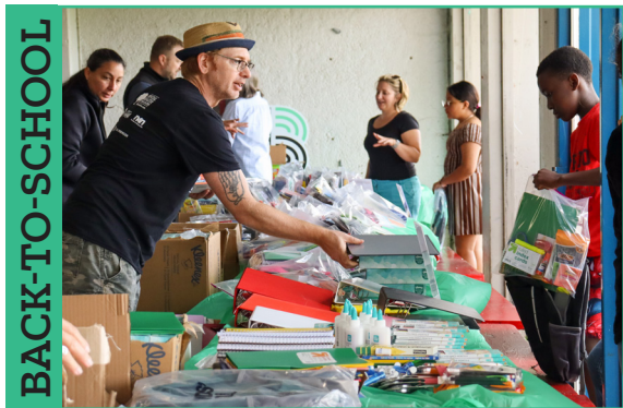
Prepping Littles for a new year with a school supply giveaway